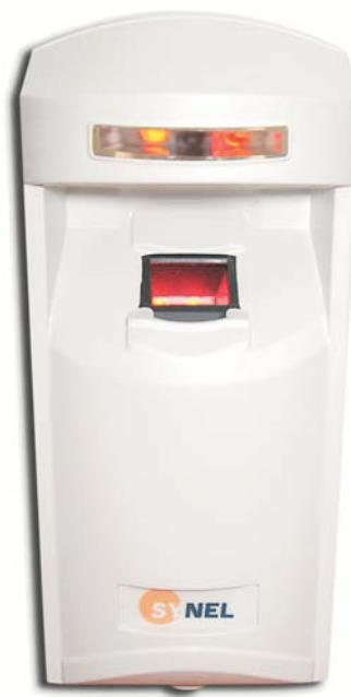
Optical sensor - PrintX-fpr/OP