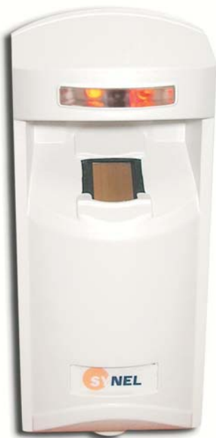
TC sensor - PrintX-fpr/TC

A biometric fingerprint reader - the highest security level for personnel recognition